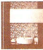
C Outline Bagno 005

Color is back in interior design. Tile follows this trend, offering designs saturated with color. Warm, neutral tones share the stage with cool-water-inspired hues.